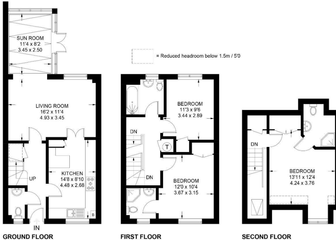
Illustration for identification purposes only, measurements are approximate, not to scale. (ID 718346)