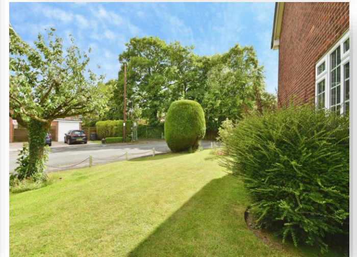
Hookstone Oval, Harrogate HG2 8QE