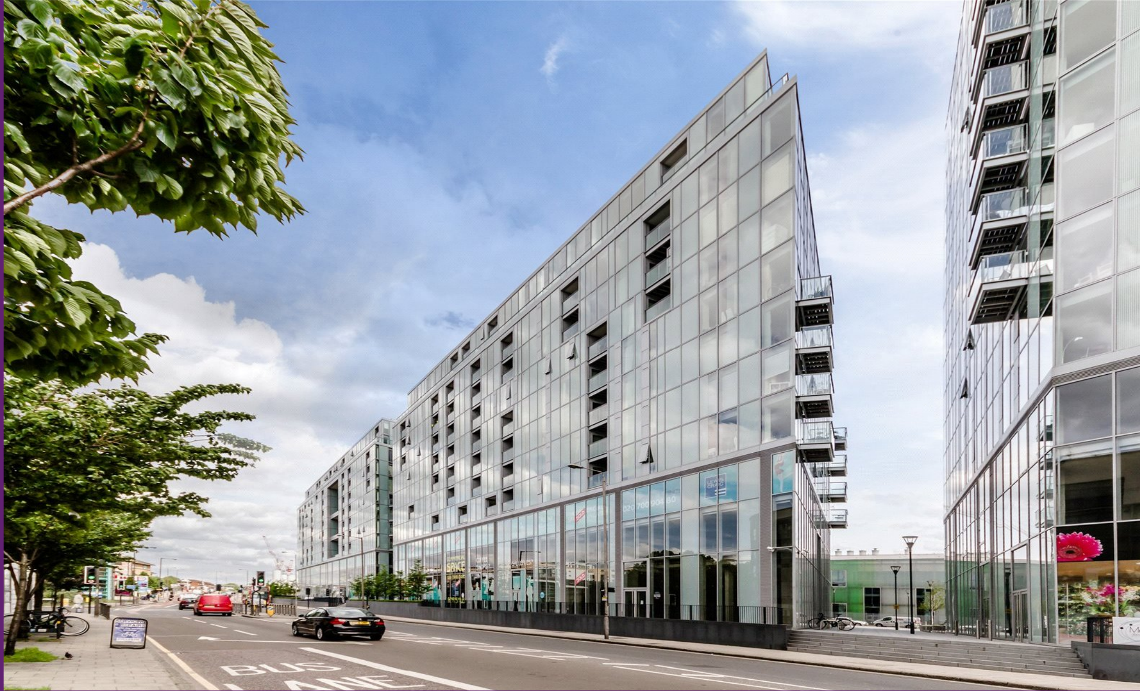
Cavatina Point 3 Dancers Way, SE8