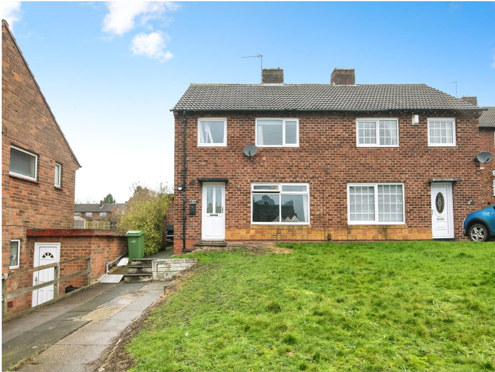
Lea Bank Road, Netherton DUDLEY DY2 0BA