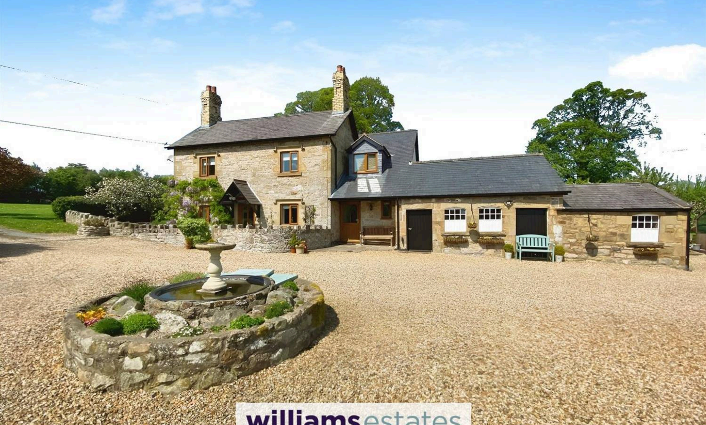
Pen Y Ffordd House Gwernaffield Road, Gwernaffield – CH7 5DB £795,000