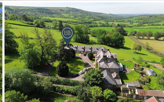
1 VALLEY VIEW, ESK HALL, SLEIGHTS- 2 bed Terraced Bungalow -£285,000