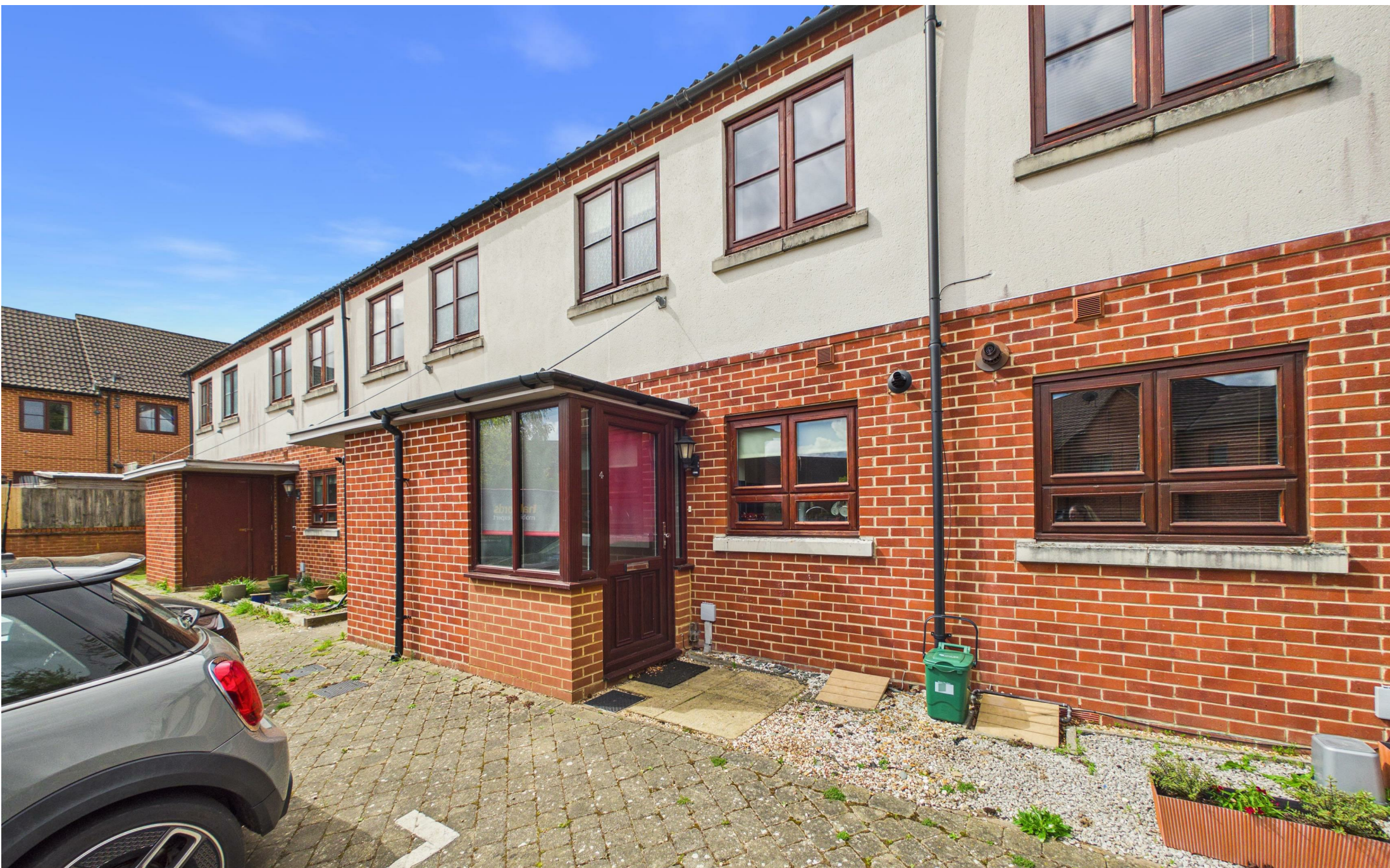
Vernhams Mews, Basingstoke, RG24 9GE