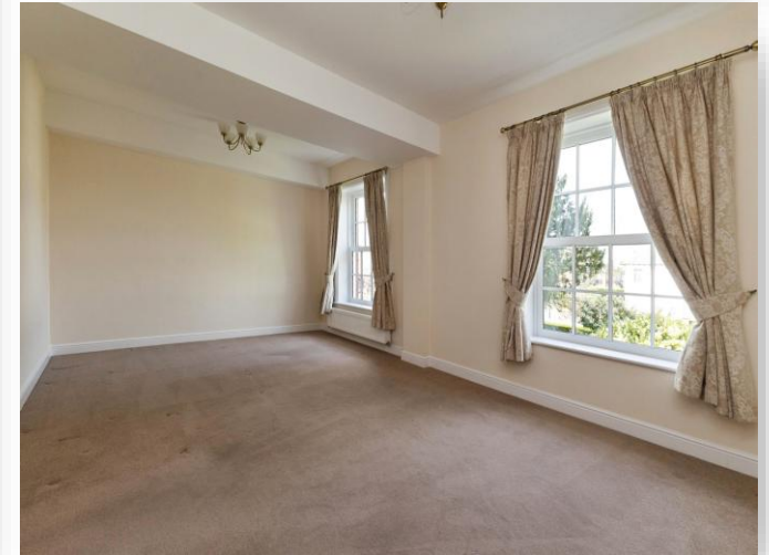
The Old College Roman Road, Middlesbrough TS5 5PQ