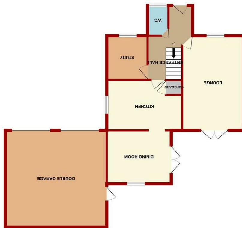
GROUND FLOOR 945 sq.ft. (87.8 sq.m.) approx.

TOTAL FLOOR AREA: 1555 sq.ft. (144.4 sq.m.) approx. Measurements are approximate. Not to scale. Illustrative purposes only. Made with Metropix ©2025