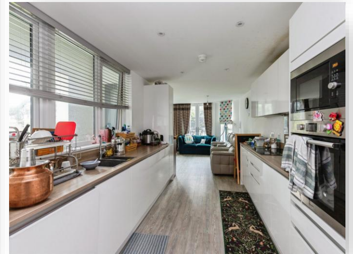
Heather Court West Cliff Road, BOURNEMOUTH BH2 5EP