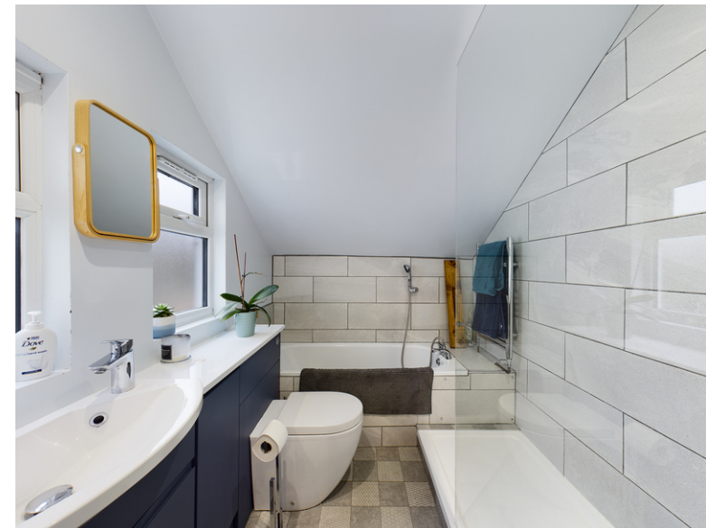
446a London Road, High Wycombe, Bucks, HP11 1LP