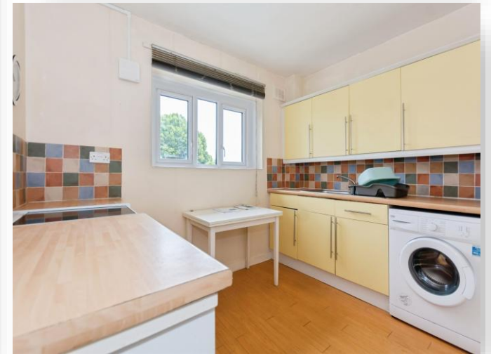
Hampshire Court Abdon Avenue, Birmingham B29 4NT