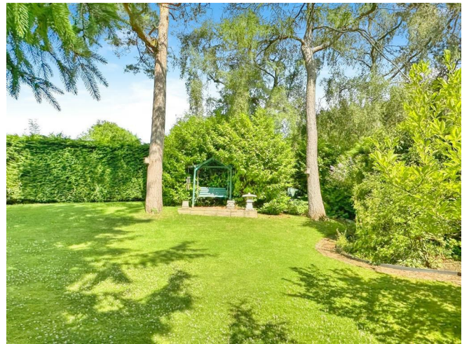
ADDITIONAL GARDEN IMAGE