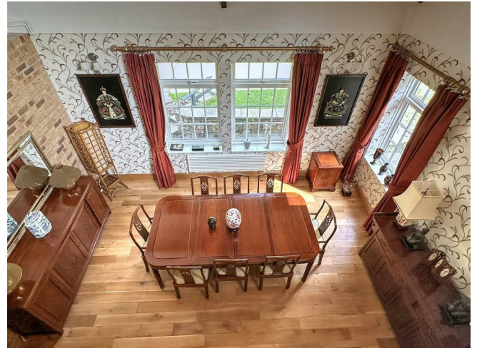
IMAGE FROM UPPER LEVEL