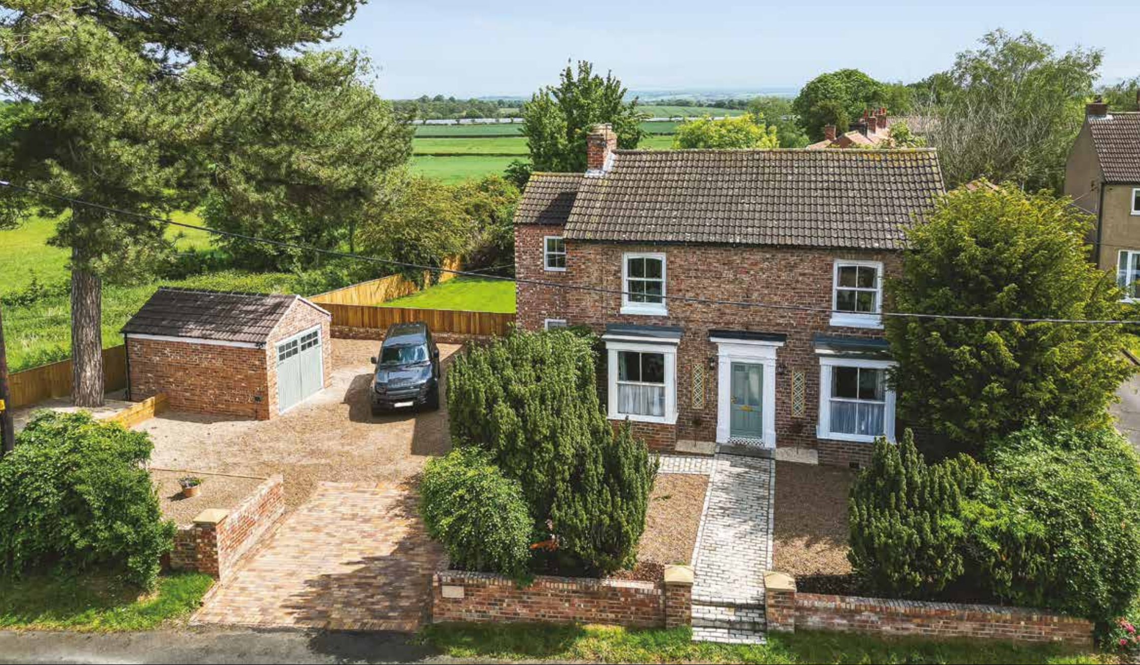
Beech House West View | Ainderby Steeple | Northallerton | DL7 9QQ