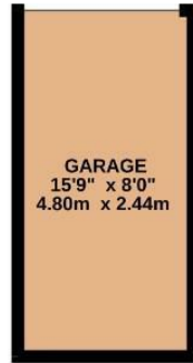
GROUND FLOOR 524 sq.ft. (48.7 sq.m.) approx.