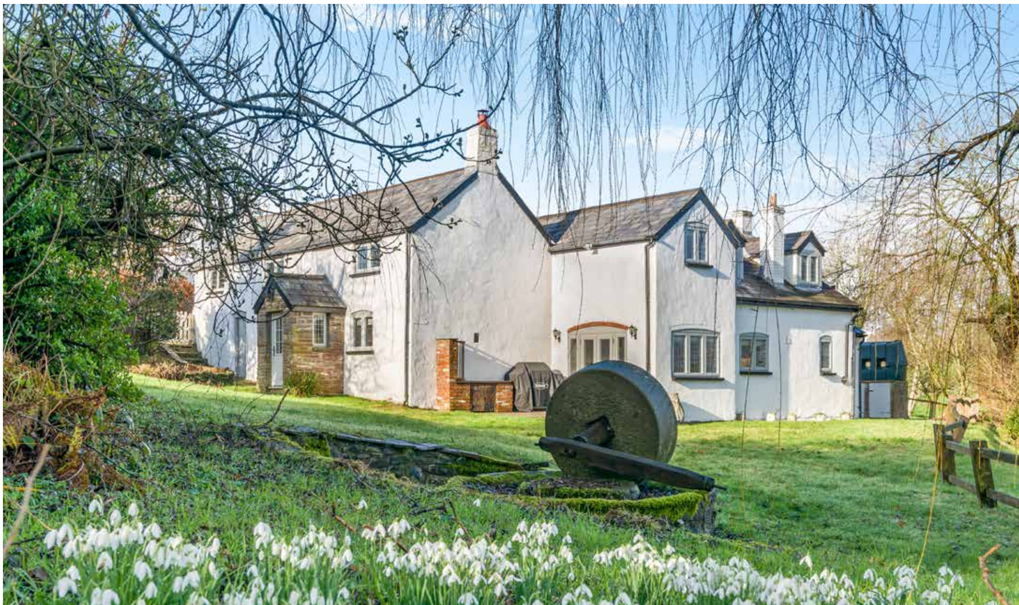
Old Cider House Kingcoed | Usk | Monmouthshire | NP15 1DS