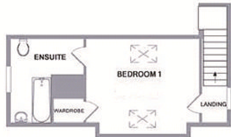
1ST FLOOR APPROX. FLOOR AREA 276 SQ.FT. (25.6 SQ.M.)

TOTAL APPROX. FLOOR AREA 1249 SQ.FT. (116.0 SQ.M.)