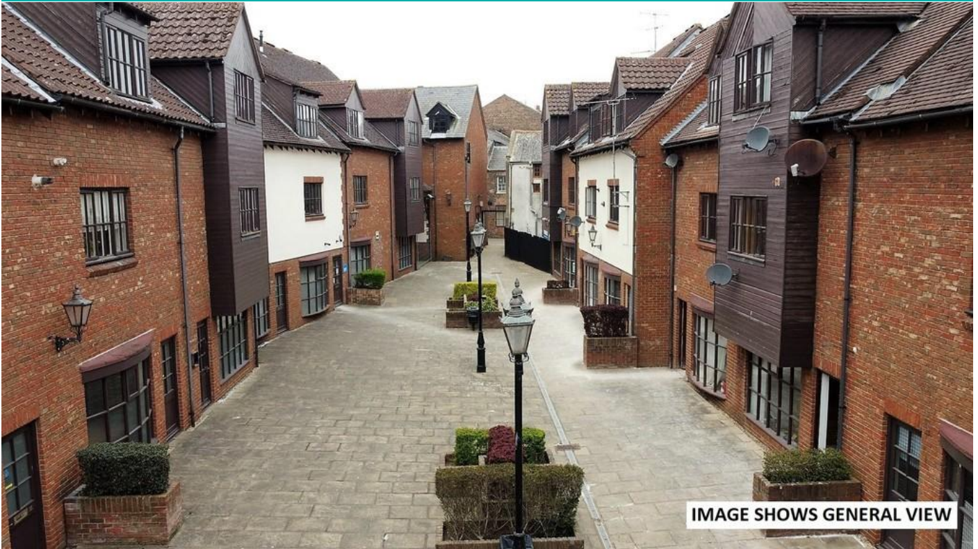
IMAGE SHOWS GENERAL VIEW