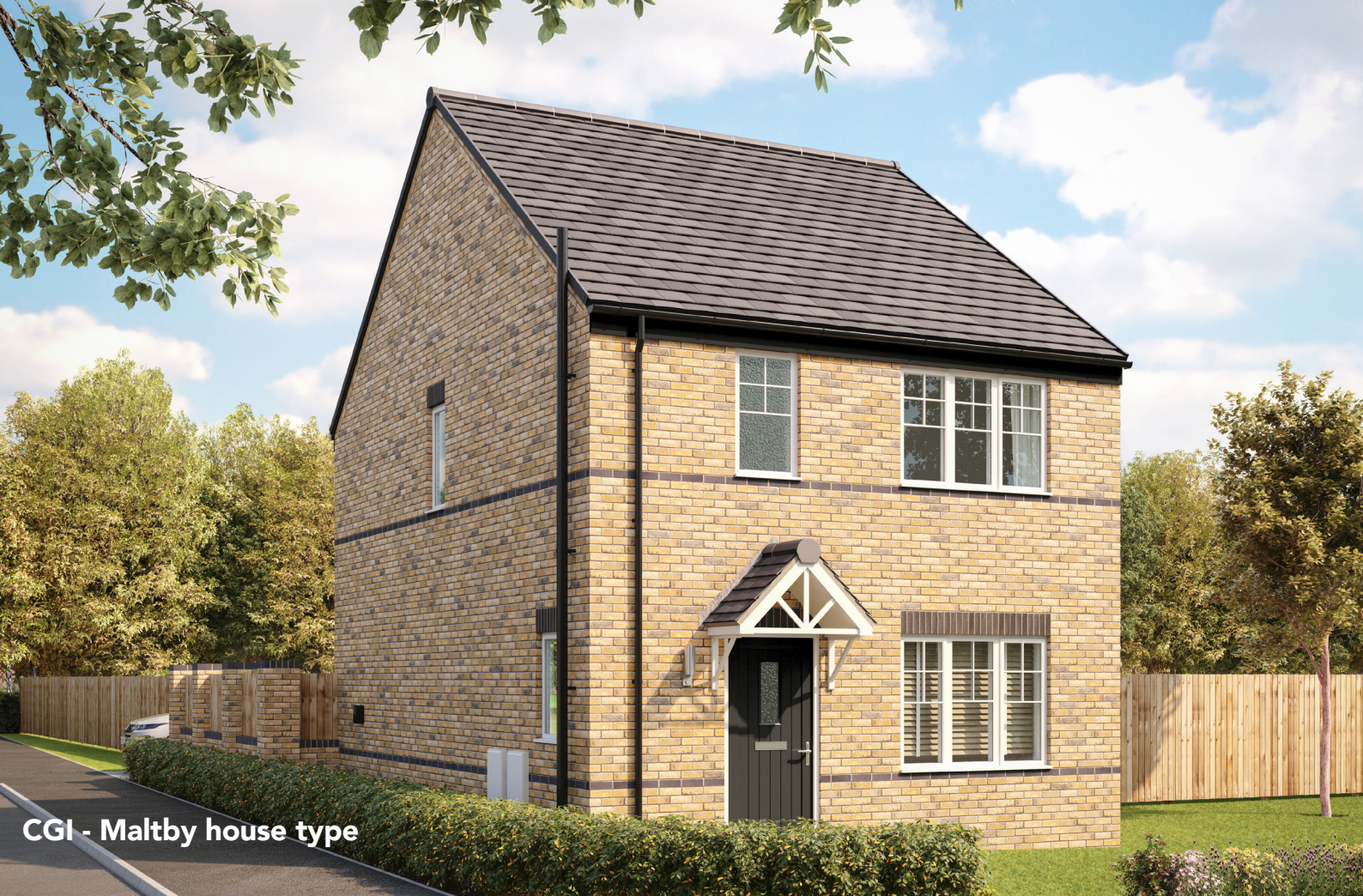
CGI - Maltby house type