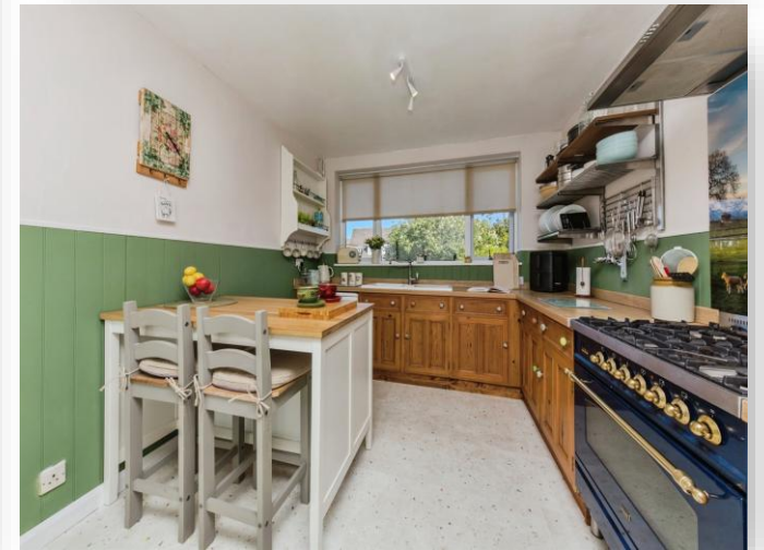
West Acres, Uttoxeter Road, Kingstone, Uttoxeter. ST14 8QH