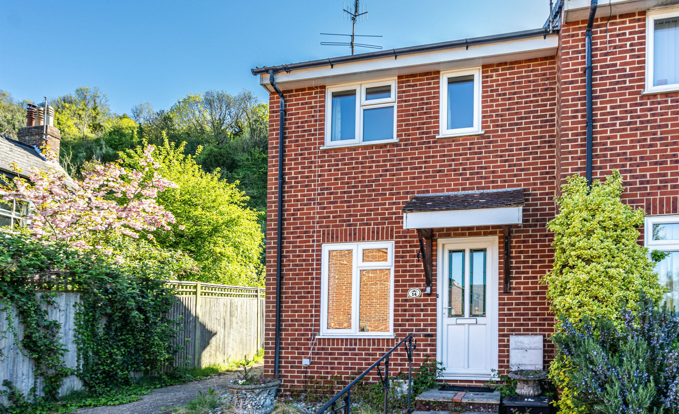
14 The Spinneys, Lewes, BN7 2RN