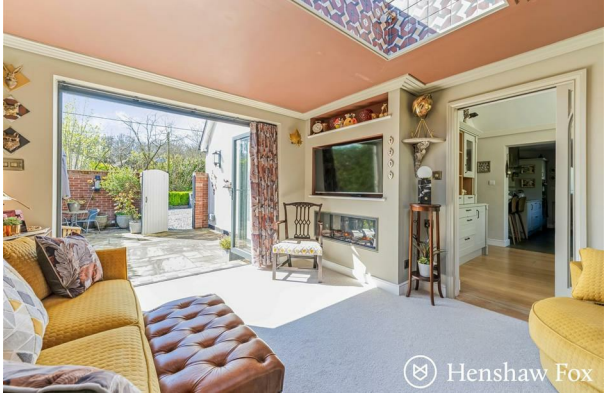
Rose Cottage | £800,000 Church Lane, Awbridge, Hampshire, SO51 0HN