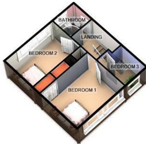
1ST FLOOR APPROX. FLOOR AREA 446 SQ.FT. (41.4 SQ.M.)