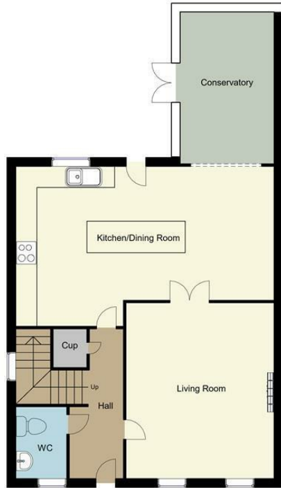
Ground Floor: 70Sq.MT/753.47Sq.FT Approx.