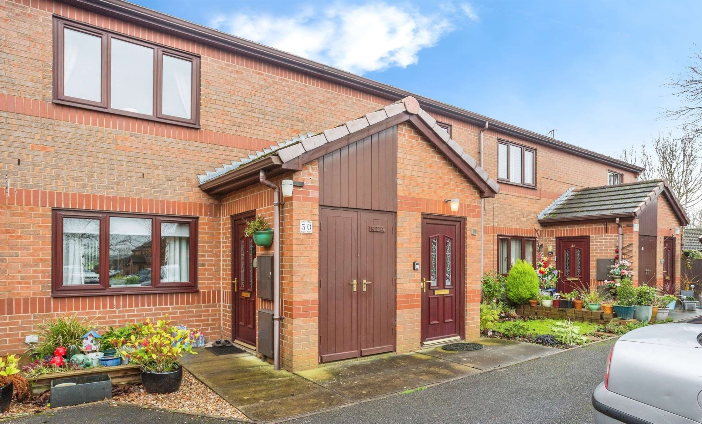
The Grove, Walton WAKEFIELD WF2 6LD