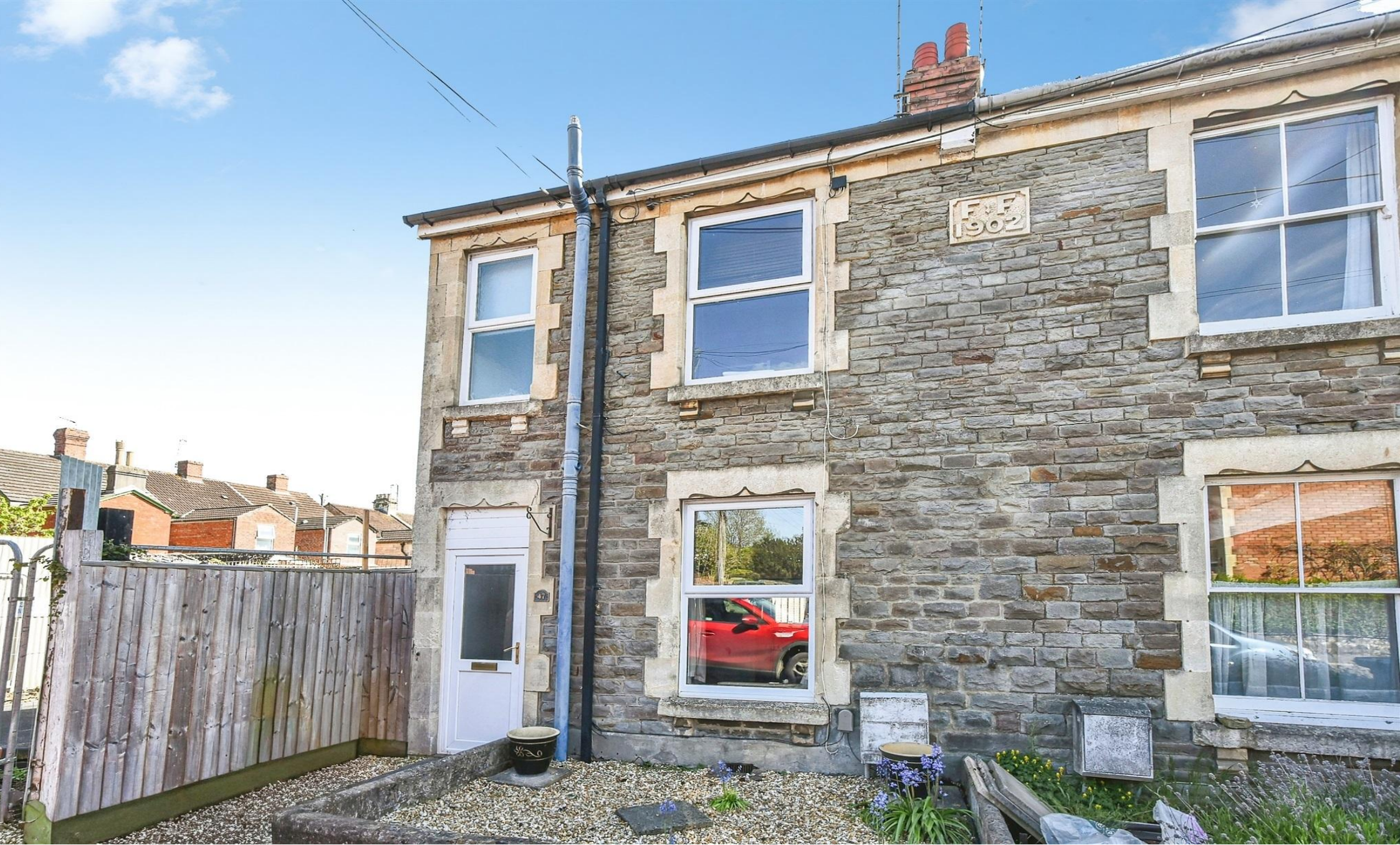
Tugela Road, Chippenham SN15 1JF