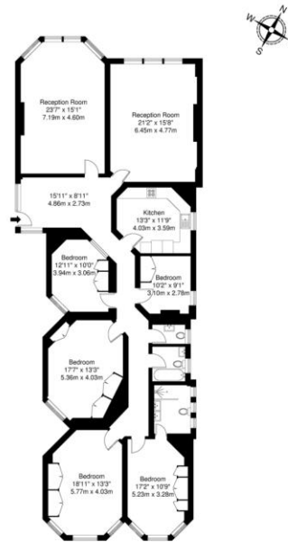
Raised Ground Floor Oakwood Court, W14 Total Gross Internal Area = 209.9 sq m / 2259 sq ft

This impressive five-bedroom apartment is available to rent on the raised ground floor of an elegant Edwardian mansion block, ideally located moments from the beautiful open spaces of Holland Park.