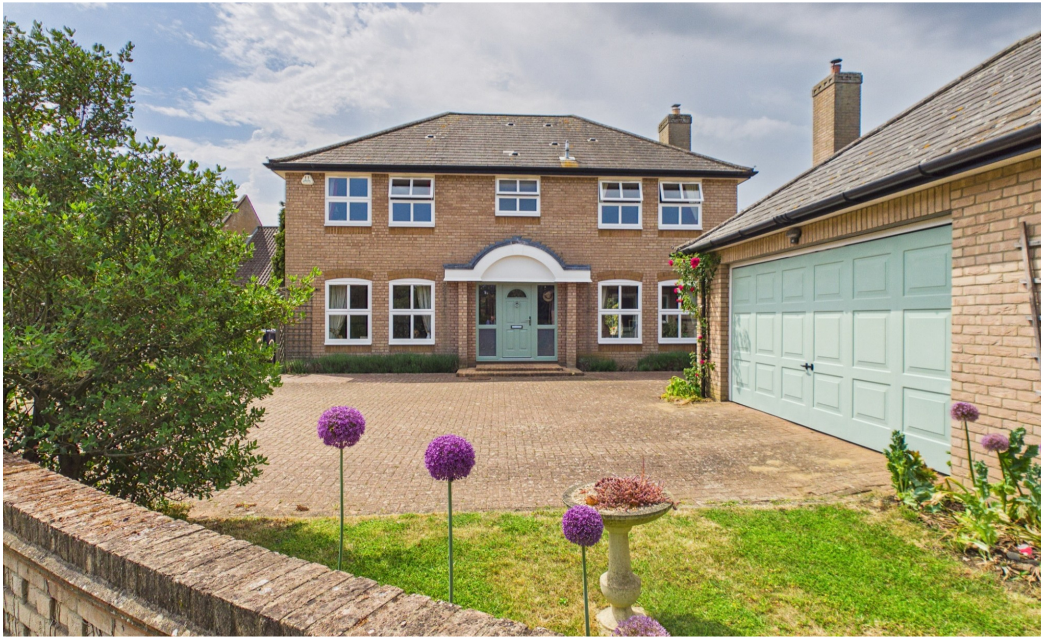
The Spinney, Cottenham CB24 8RN