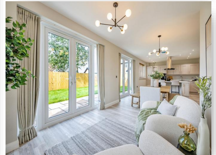
Plot 1 The Hawthorns, Scropton Derby DE65 5PP