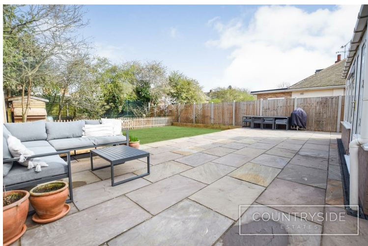
Rear Garden approx 60' x 38' (approx 18.29m x 11.58m)

Large patio area with remainder laid to lawn. Flower beds, log store, fully fenced boundary, wide side access, external lighting, water tap.