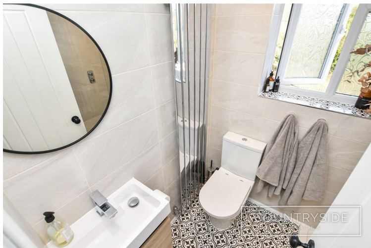
Shower Room 6'0" x 5'3" (1.83m x 1.60m)

Window to rear aspect, tiled flooring, fully tiled walls, smooth plastered ceiling, vanity unit with inset hand wash basin and chrome mixer tap, close coupled W.C, large shower cubicle with glass screen and waterfall shower feature, chrome radiator.