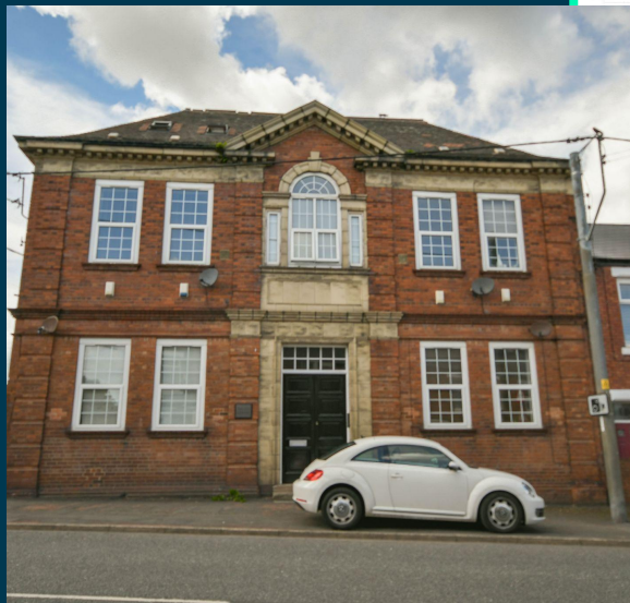
Grey Terrace, Sunderland, SR2