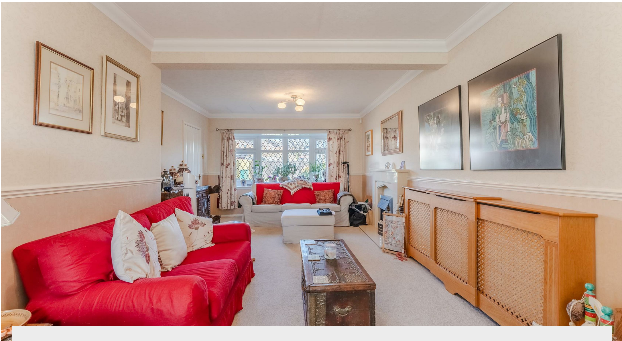
Superb Views To The Rear.