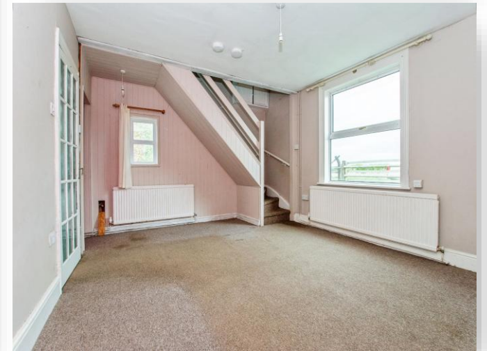
Roses Cottages Broadgate, Sutton St. James Spalding PE12 0JT