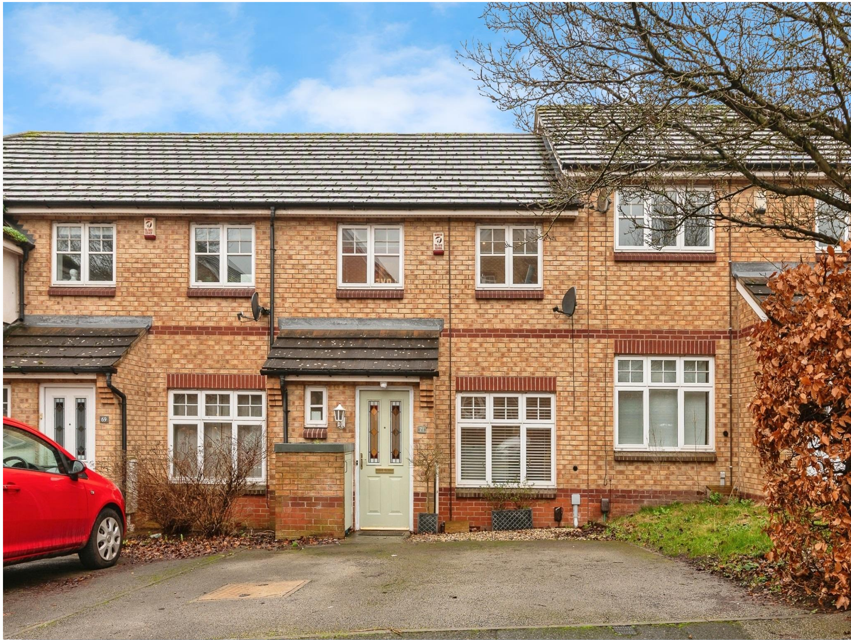
Sheridan Way, Nottingham NG5 1QH