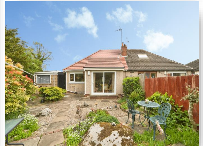
Beckfield Road, Bingley BD16 1QS