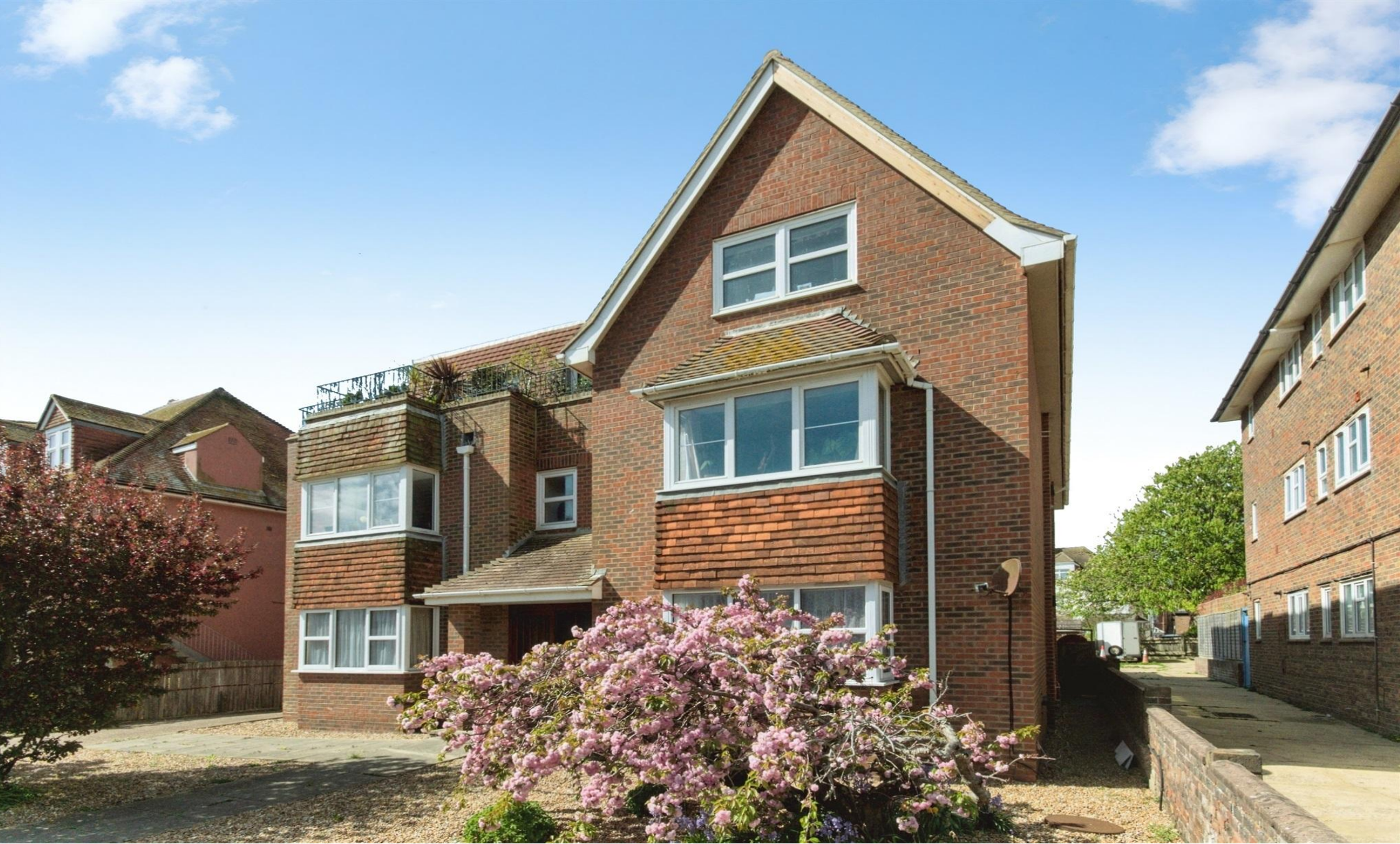
St Aubyns - Brassey Road, Bexhill-On-Sea TN40 1LD