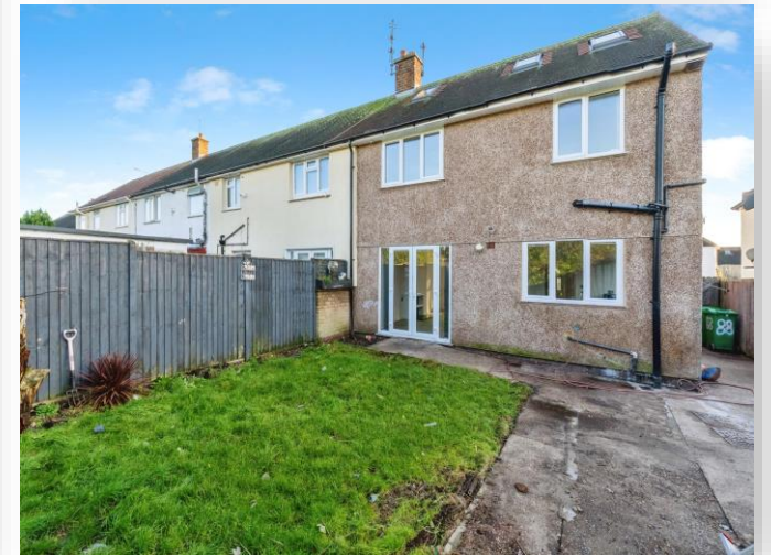
Stirling Grove, Nottingham NG11 9AJ