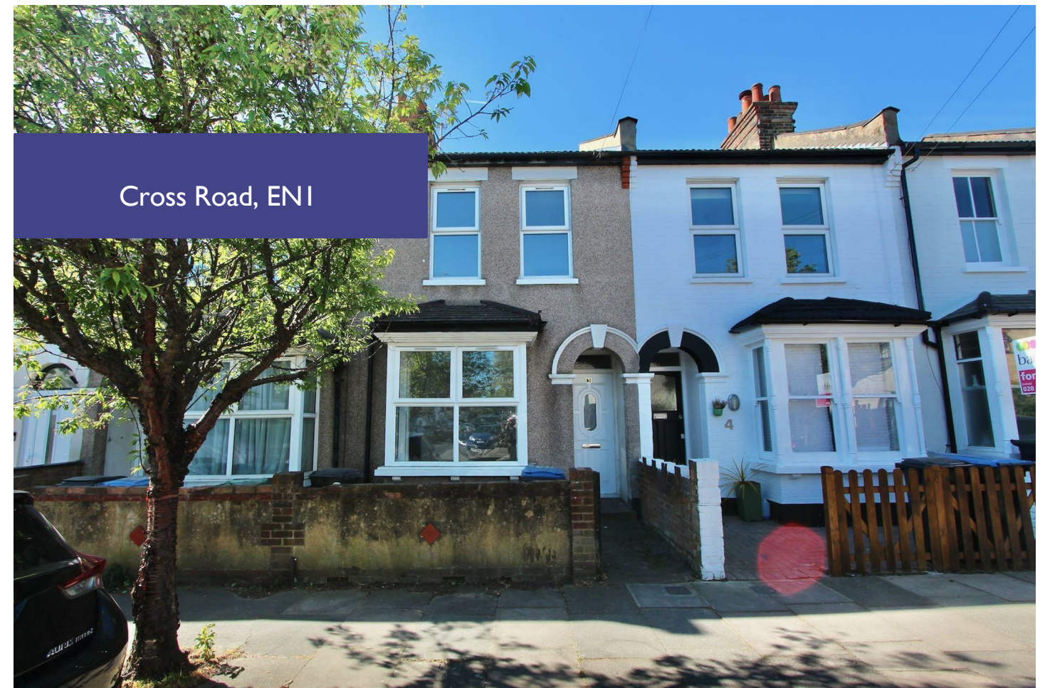
Cross Road, EN1