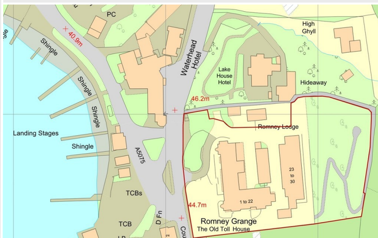
Ordnance Survey Map Ref M4P-01194966