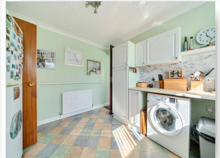
Honeysuckle Close, Sutton-On-Sea Mablethorpe LN12 2ST