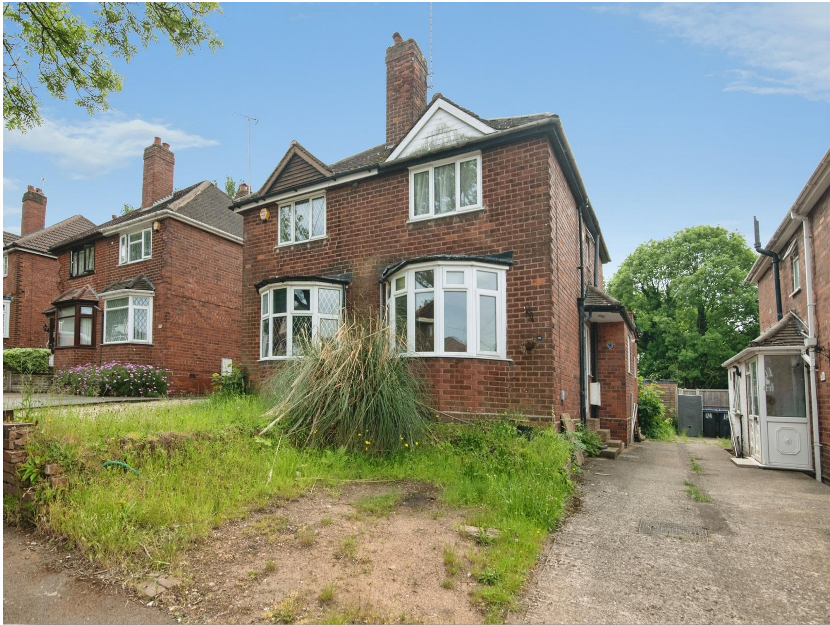
Dyas Avenue, Birmingham B42 1HF