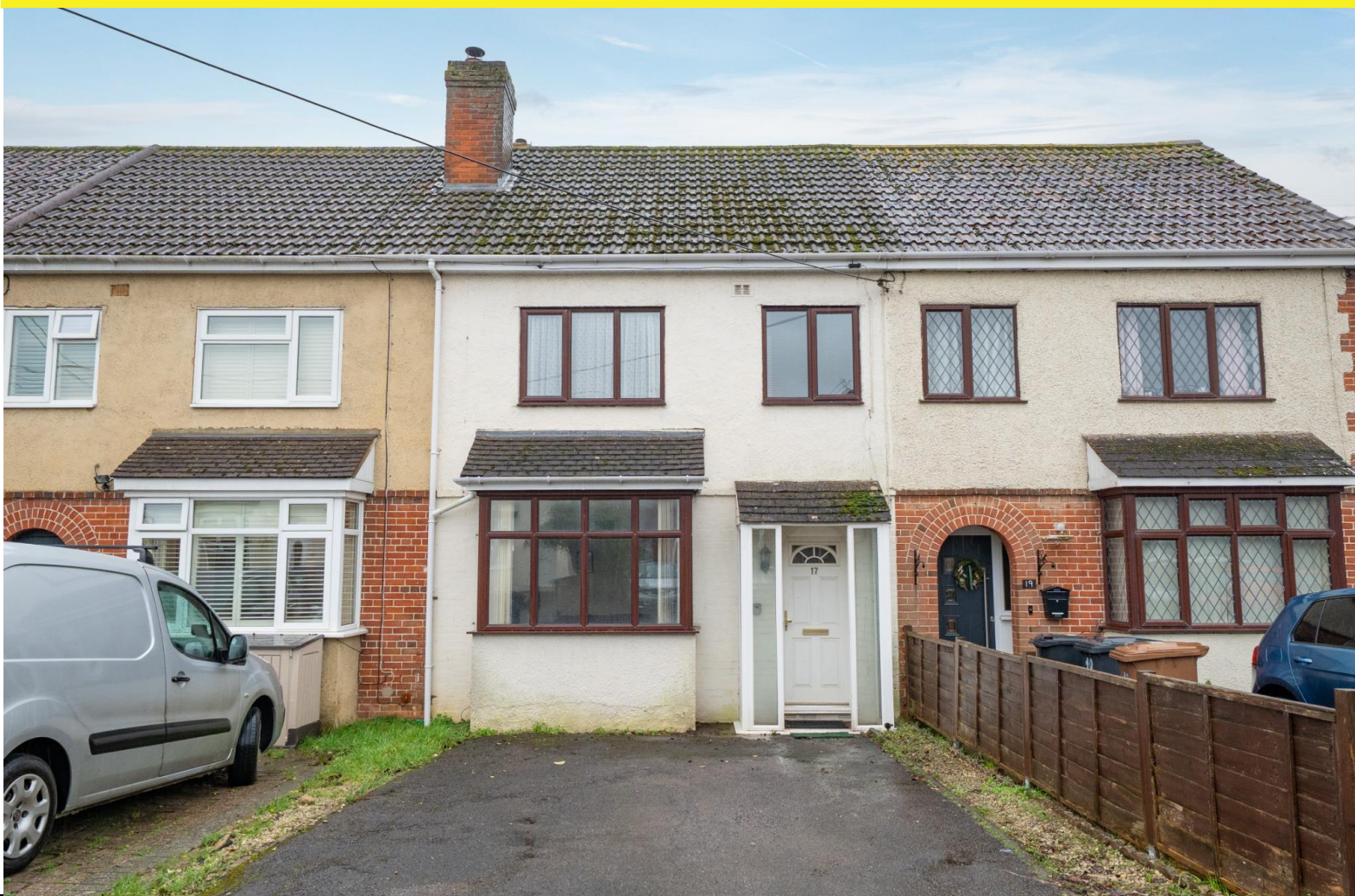
The Crescent, Andover Guide Price £323,500