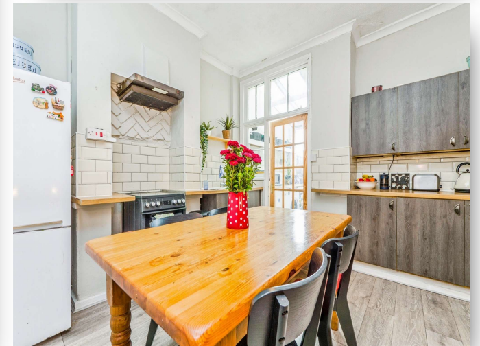
Africa Gardens, Heath Cardiff CF14 3BT