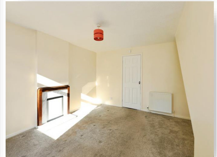
Fleet Close, Brampton Bierlow Rotherham S63 6DA