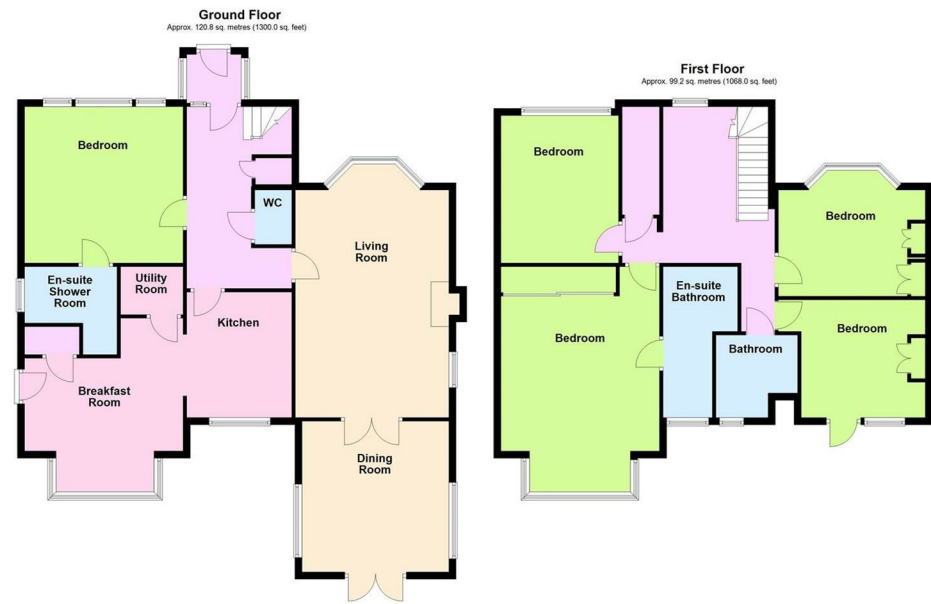
Total area: approx. 220.0 sq. metres (2368.0 sq. feet)