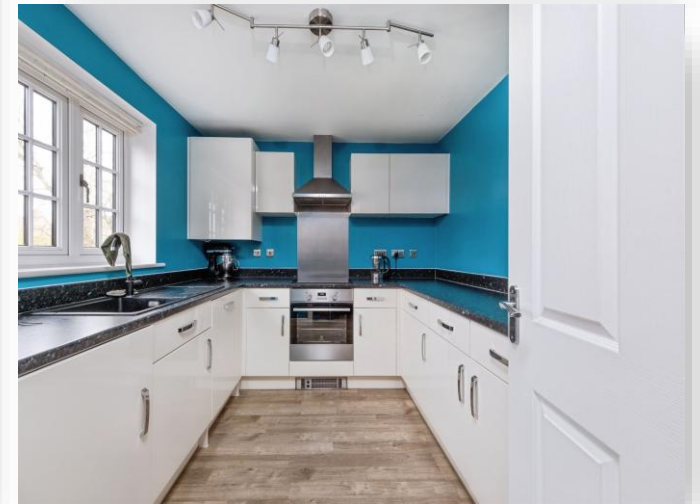
Aintree Avenue, Towcester NN12 6NR