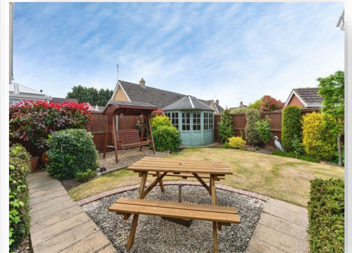
Morley Way, Wimblington PE15 0NR