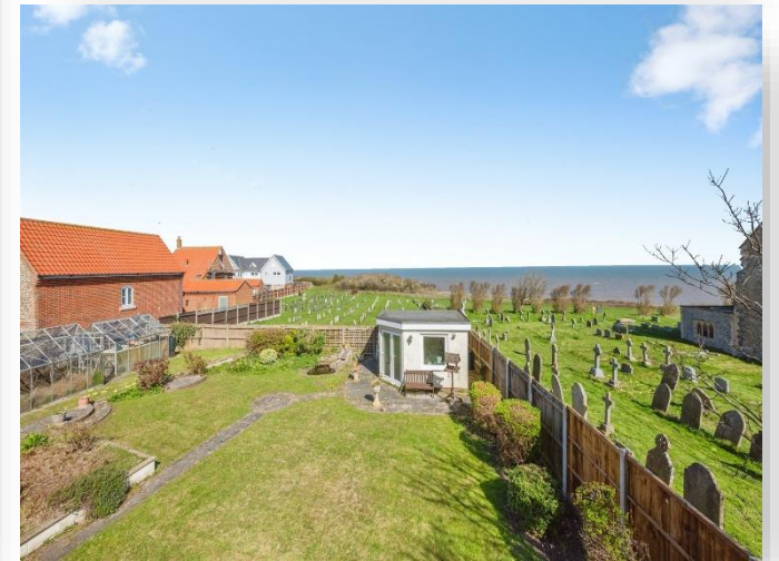
Cromer Road, Mundesley NR11 8DB