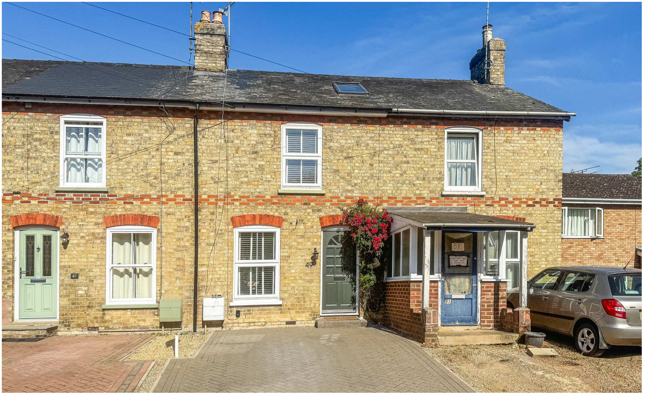
Mill Lane, Fordham, Ely, Cambridgeshire