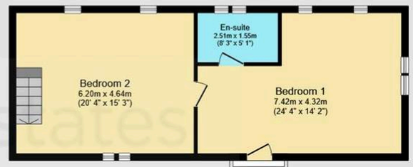
First Floor Floor area 52.5 sq.m. (566 sq.ft.)

Total floor area: 125.2 sq.m. (1,348 sq.ft.)